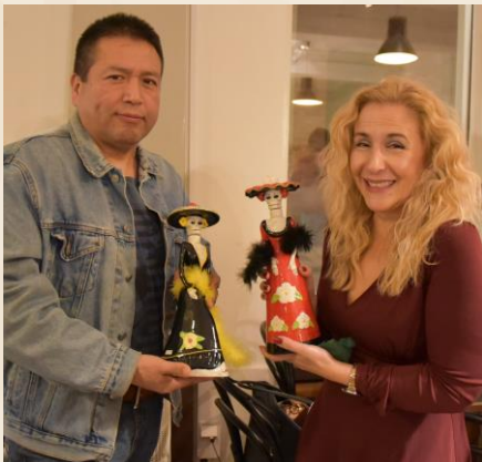
Winners of the ceramic figures of Catrina.

Projection of the film Roma at the Cervantes Institute in Stockholm in the framework of the celebration of the International Women's Day.