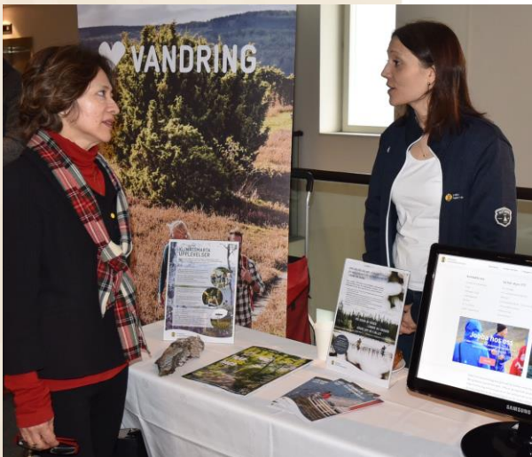
Sustainable Tourism Platform.