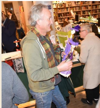
Winner of the two artisan figures from the Catrina.