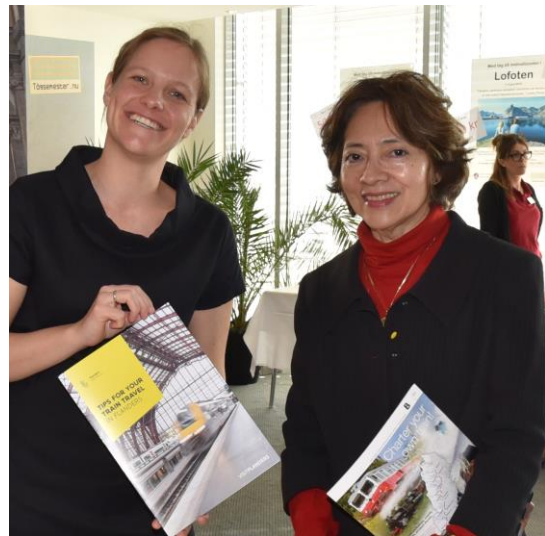
Dialog with tour operators.