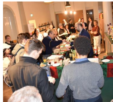
Reception after film Roma at Instituto Cervantes, Stockholm.