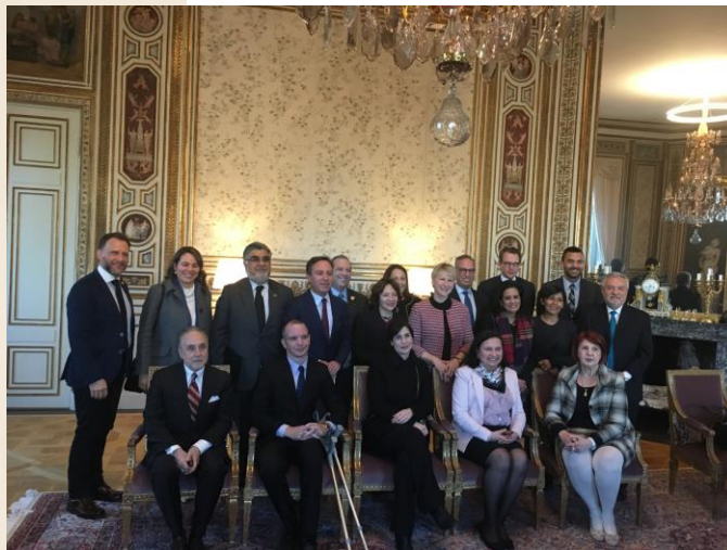
The Minister of Foreign Affairs of Sweden Margot Wallström (standing in the centre) with GRULAC members. Dr. Rivera Gómez stands on her right side.

O n March 20, 2019, the Chargée d’Affaires, a.i., Dr. Audrey Rivera Gómez participated in a meeting within the Group of Latin American and Caribbean Countries (GRULAC) with the Minister for Foreign Affairs of Sweden Margot Wallström, both parties centred the dialogued on the Ministry’s proposal document called "Plan of Action for Latin America and the Caribbean". The Ministry’s Initiative reflects Sweden's interest in strengthening the relationship with the Latin American and Caribbean region and reinforcing a permanent dialogue.