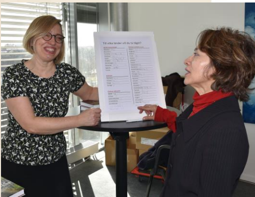
Dialog with tour operators.