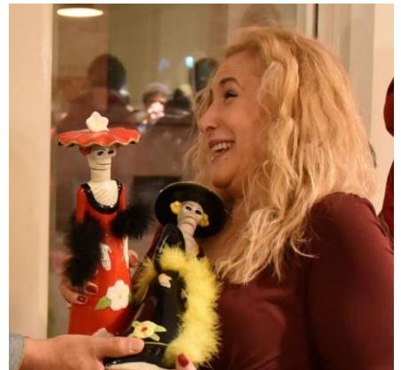
Winner of the ceramic figure of Catrina.