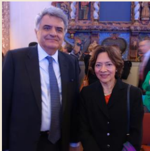
Chargée d’Affaires Audrey Rivera Gómez with the Ambassador of Greece Dimitrios Touloupas

Chargée d’Affaires Audrey Rivera Gómez Attends Celebration of the National Day of Greece