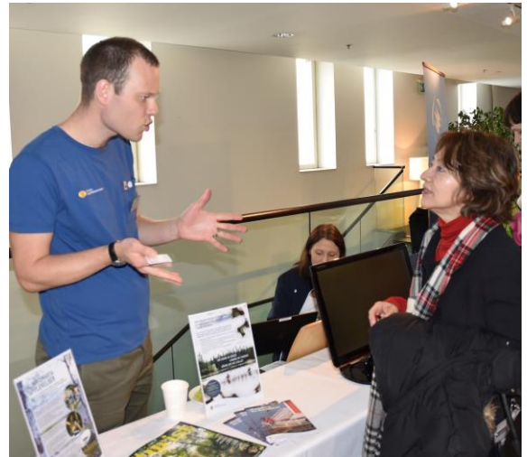
Sustainable Tourism Platform.