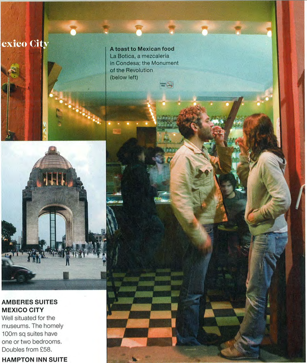
A toast to Mexican food La Botica, a mezcalería in Condesa; the Monument of the Revolution (below left)