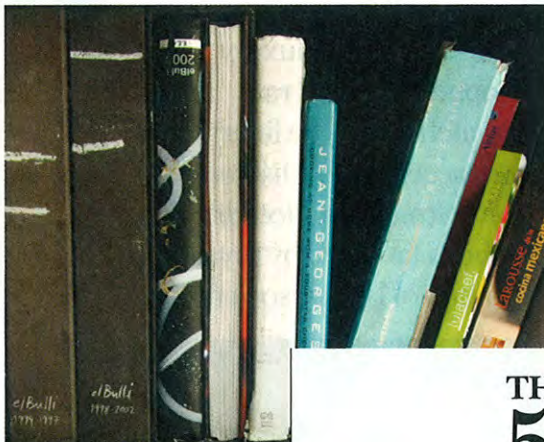
In the red Radishes straight from market; Pujol's bookshelf (above) includes tomes from el Bulli, which has attracted many Mexican chefs

If anywhere could make New York, London and Paris look stagnant it's here. I can't even say it's a passing