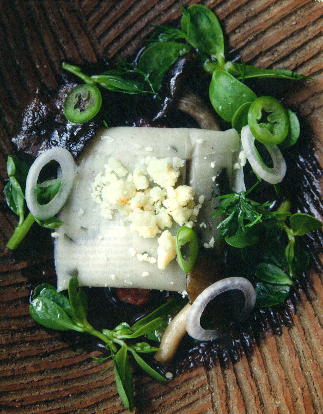
Artwork you can eat Mushrooms with verdolaga leaf and cheese at top restaurant Pujol in the Polanco district of Mexico City; its acclaimed chef, Enrique Olvera (opposite)