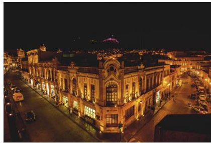
Explore downtown Zacatecas