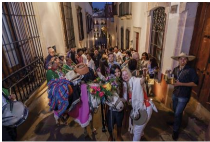
Experience a "Callejonada"

Zacatecas has its origin as a mining state, because its foundation was precisely due to the silver deposits discovery, around which the city developed. Thus, it also became one of the main economic centers of Nueva España. To learn more about Zacatecas mining, it is recommended to get on the train that goes into the depths of El Edén mine. Its tunnels are full with stories and legends, a museum and the unforgettable experience of visiting a real mine.