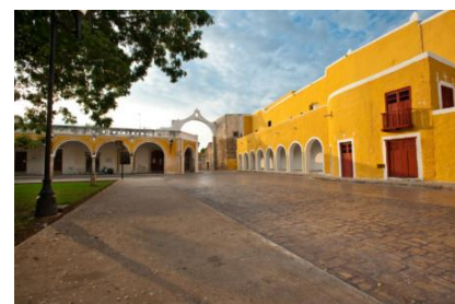
Explore the city of three cultures: Izamal