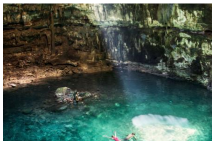
Dive in the cenotes of Cuzamá

Mérida, the capital of Yucatán, arose from the merger of three major cultures: Mayan, Spanish and Lebanese, that together conferred it with a unique personality palpable in its architecture, cuisine and people. In this magical city, tradition and modernity go hand by hand. Impressive archaeological sites, colonial and modern buildings coexist in harmony.