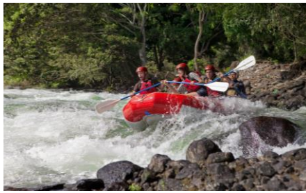
Raft and tube in Jalcomulco