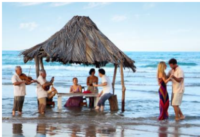
Listen to jarocho music while relaxing in Tuxpan

Veracruz port is a place with a festive atmosphere. There are various attractions, among which the boardwalk stands out, it is ideal for a walk in the afternoon. The Aquarium is located on the boardwalk, this aquarium has the largest sea fish tank in Latin America. In its waters swim Gulf of Mexico's endemic species. The closest beaches are Mocambo which is south to the pier, and Chachalacas, an hour trip north on Highway Cardel.