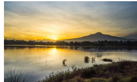
Take a boat ride in Laguna de Acuitlapilco