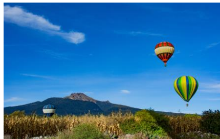
Enjoy an unforgettable experience by riding an air-hot balloon