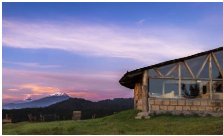
Camp in a firefly sanctuary in Nanacamilpa