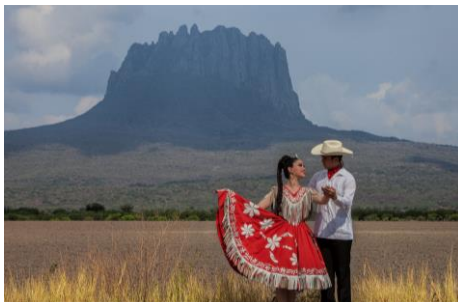
Witness the beautiful views of Cerro del Bernal