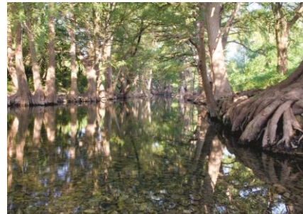
Enjoy a quiet time in Los Troncones park