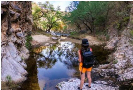
Tour the Magical Town of Santiago

The state of Sonora is the second largest state in Mexico, surrounded by sea, desert and mountains. It is the ideal destination for any traveler who wants to mix sports with beach and cultural activities. You can choose between a relaxing holiday, enjoying the beautiful landscapes like a sunset with amazing colors in the sky and the waves of the Sea of Cortez, or you can have a holiday full of excitement on places that are perfect for extreme sports.