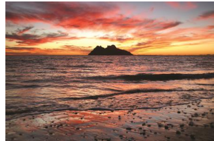
Explore the Grutas de García