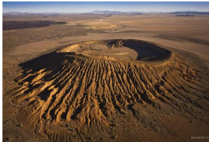
Enjoy a boat ride in Paseo Santa Lucía