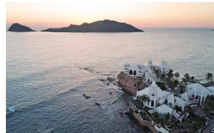
Embark on an excursion to Deer Island