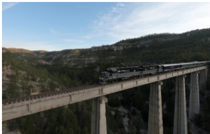
Ride in El Chepe train

Discover the charm of its magical towns (Cosalá, El Fuerte, El Rosario and Mocorito) and its picturesque villages with cobbled streets. About Sinaloa is only known that these lands were the passage of different tribes on their way to the center of the country leaving as testimony petroglyphs located in various communities.