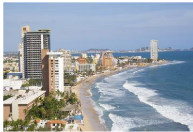
Relax in Mazatlan's beach