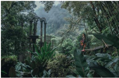
Connect with nature in Xilitla's surreal garden

Among other qualities, San Luis Potosi has an exuberant biodiversity and ecological reserves ideal for ecotourism. Its territory contains much of the Huasteca, which favors it to be the state with the biggest amount of waterfalls in the country.