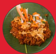
Zacahuil of Huasteca