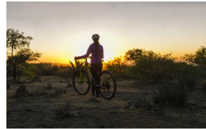
Bike to Sendero El Capitán