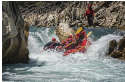
Raft in the Huasteca Potosina (Tampaon River)