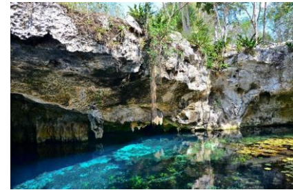
Visit the Gran Cenote of Tulum