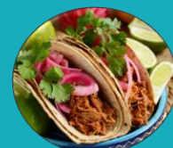
Cochinita pibil (pork)