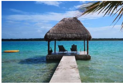
Visit the Lagoon of 7 colors in Bacalar

Part of the so-called Mundo Maya , Quintana Roo is one of the best tourist states across the country. Its Riviera is known worldwide for its idyllic landscapes, activities of all kinds, cuisine of great proportions and its incomparable beauty of Mayan monuments. Quintana Roo has options for all kinds of travelers, from those who expect the ultimate in luxury to those who prefer the simplest places in contact with nature .