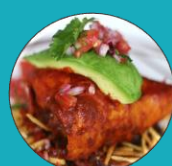
Tikin Xic fish