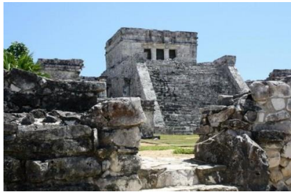
Explore the ruins of Cozumel