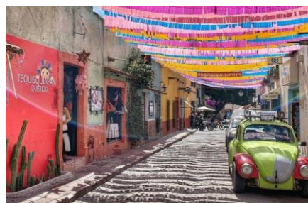
Walk around Tequisquiapan

Knowing Queretaro and his monumental history is an excellent plan to begin a tour of colonial Mexico. Regarded as the cradle of independence, Queretaro has a strategic position that has become one of the major players in Mexico's history.