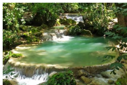
Walk in nature, camping, or simply relax in the Chuvejé Waterfall