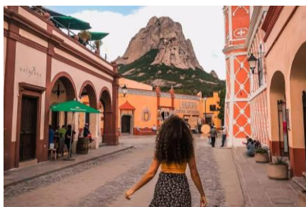
Visit La Peña de Bernal