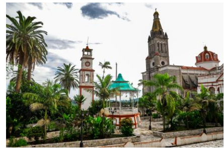
Explore the Grutas de García