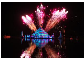
Festival of Light and Life in Chignahuapan

Experience some of the greatest Mexican traditions, history, and culture