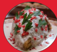
Chile en Nogada