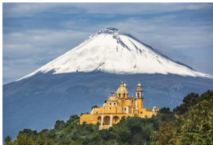
Enjoy a boat ride in Paseo Santa Lucía