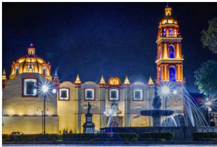
Tour the Magical Town of Santiago

Be amazed with the splendor of its elegant colonial buildings, its streets and flavors that honor its nickname "the city of angels". Legend has it that after the construction of the Cathedral of Our Lady of the Immaculate Conception, engineers and architects wondered how to carry a bell of 8000 kilos. One morning, residents awoke to the news that it was already at the top. This legend is responsible for this beautiful city being called Puebla de los Angeles.