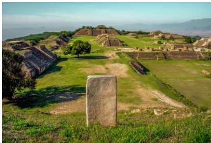
Learn about the Zapotec culture in Monte Albán