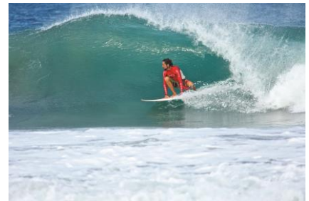
Surf in the beaches of Zicatela