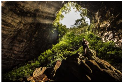
Explore nature in Huautla de Jiménez

Oaxaca is a state that surrounds you with an atmosphere of tradition, nature and flavor. The state is located in the southwestern region of the country and borders the states of Puebla, Veracruz, Chiapas and Guerrero. The downtown of its capital, Oaxaca de Juárez, is considered a World Heritage Site by the UNESCO and the beauty of its architecture, traditions and culture are proof of this recognition.