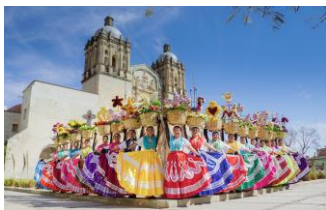
Chinas Oaxaqueñas in Plaza de Santo Domingo