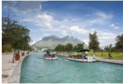
Enjoy a boat ride in Paseo Santa Lucía