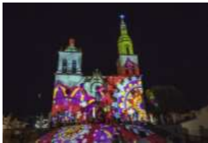
Tour the Magical Town of Santiago

Be surprised in this mostly desert-like region where you will find, in the Sierra Madre (the Mother's Mountain Range), an oasis of natural beauty. Nuevo Leon offers so many varied attractions for adventure and vertigo lovers. Having what's considered as the second city in economic importance of the country, it also offers a complete tourism infrastructure open to receive the most experienced and demanding travelers with a wide cultural and entertainment offer.