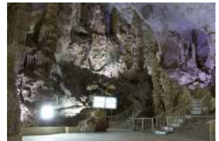
Explore the Grutas de García