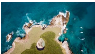
Playa del Amor, Islas Marietas