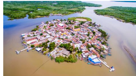
Enjoy a magical vacation on Isla de Mexcaltitán