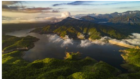
La Yesca Dam