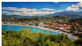
Rincón de Guayabitos