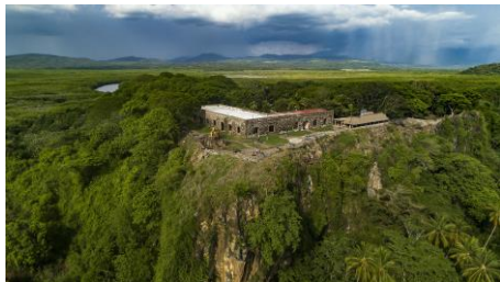
Tour La Contaduría fort in San Blas

If you are looking for tranquility and a natural preserved environment, then visit Nayarit and its 305 kilometers of pristine coastline. The coast ports, both picturesque and peaceful, welcome you to know a little about the Huichol culture. Nayarit is perfect for those who like both historical tours and outdoor activities like diving or swimming in the "World's Greatest Pool".