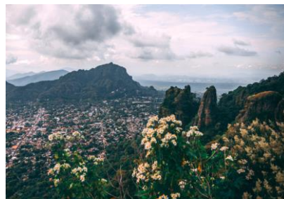
Hike to the top of the Tepozteco for astonishing views of Tepoztlán