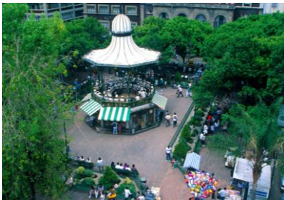
Walk around downtown Cuernavaca

Follow the footsteps of the ancient Augustinian, Dominican and Franciscan friars when visiting some of the first temples, convents and churches of European styles that were built in the region for the evangelization of the population. Walk the streets of the so-known state of “eternal spring” in a pilgrimage to Mexico's interesting colonial past. Its name comes from its warm, suitable to practice outdoor activities climate.