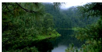
Lagunas de Zempoala