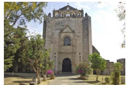
Visit the Magical Town of Tlayacapan