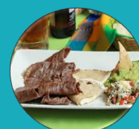
Cecina from Yecapixtla