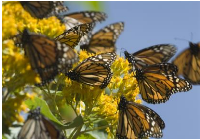
Visit the Monarch Butterfly Sanctuary

The historical center of the Michoacán capital is a world heritage site by UNESCO, few cities include such a strong, diverse and well-preserved colonial architecture as Morelia. Walking its clean streets is to enjoy a walk through the history of the state of Michoacán. Walking through the geography of the state requires you to visit its markets and squares that show the whole splendor of its gastronomy.