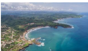
Caleta de Campos