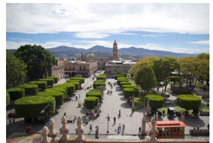
Walk around the Historic Centre of Morelia, a UNESCO world heritage site