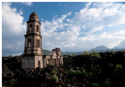
Visit the Ruins of the San Juan Viejo Temple