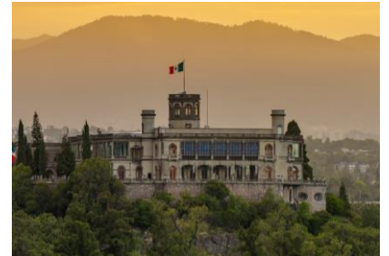
Walk around the Chapultepec Castle