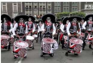
Day of the Dead parade in November