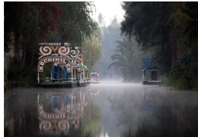
Ride a trajinera in Xochimilco