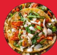
Tacos al pastor