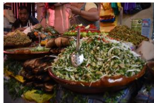
Enjoy traditional Mexican cuisine at a local food market

"Coyoacán known as Land of Coyotes is located on the south side of Mexico City, and this beautiful is a must when you come to Mexico City. In here you can visit the Mercado de Coyoacán, and have a taste of local cuisine, my favorite, Las Tostadas de Coyoacán."