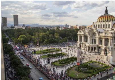
Visit the murals in the Palacio de Bellas Artes

Mexico City is one of the most enjoyable destinations. Its historic center, better known as Zocalo, is declared World Heritage by UNESCO and is the heart of a living culture that exudes everything accumulated since the founding of Tenochtitlan. Visit its neighborhoods flooded with art nouveau and art deco, enjoy its cuisine and lose yourself in the streets of the city with the most museums in the world.