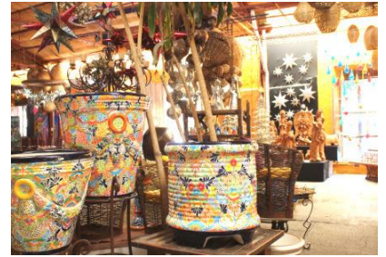
Buy Mexican handicrafts in Tlaquepaque