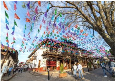
Explore Mazamitla, the forest kingdom

Mariachis and Tequila are brought together in the central-western part of Mexico, geographic point where the state of Jalisco is located, with its kind lands that have become a synonym of Mexicanity. A trip through some of the corners of Jalisco can become an exciting adventure, like performing various ecotourism activities such as camping and water sports, which allow an approach with nature.