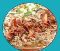
Carne en su jugo