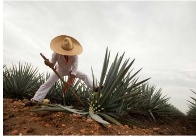
Learn about the origin of tequila