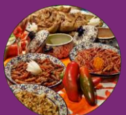
Gusanos de maguey