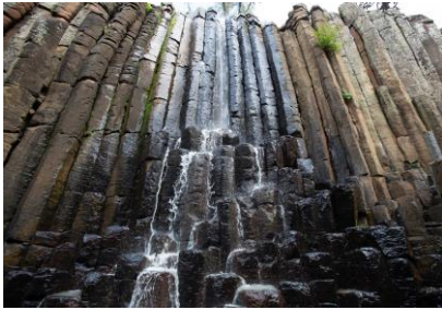
Take a splash in the Balsatic Prisms

Hidalgo promises visitors a wide range of options, from outdoor activities to cultural immersion in the ancient and recent history, in addition to a rich culinary tradition. Its basalt prisms, mining history, thermal waters and archaeological sites provide travelers an unforgettable experience.