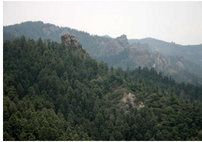
Camp in El Chico National Park