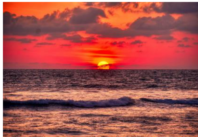
Watch the sunset in Acapulco