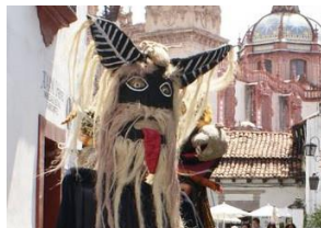
Dance of the Devils

"When in Guanajuato and going with your significant other, the Alley of the Kiss is a must visit and the photo too. Legend has it if you cross and don't kiss, bad luck ensures!"