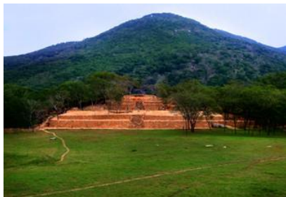
Explore the archaeological site of Tehuacalco

World famous, the Acapulco port is still the classical beach destination of Mexico. However, Acapulco is one of many beach destinations of the state of Guerrero, and it is part of the touristic route called "Triángulo del Sol" or Sun Triangle, which includes Ixtapa, Zihuatanejo and Taxco.