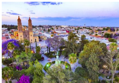
Witness the heroic story behind Mexican Independence in Dolores, Hidalgo