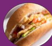
Guacamaya (pork sandwich)