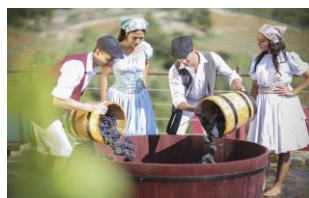
Route of the Wine