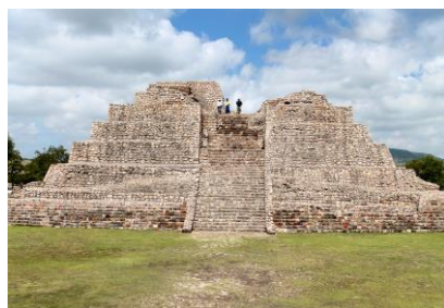
Discover the Otomi archaeological site of Cañada de la Virgen

The city of Guanajuato, declared Patrimony of the Humanity by UNESCO, and the "Ruta de las Minas" or Mines route, that cross-cuts its municipalities, and its scrumptious and honest gastronomy make this state an excellent destination that reunites Mexican traditions with the novohispano culture. Just as bright in its underground lifestyle as in surface, Guanajuato is the headquarters of some of the most important cultural samples in the world: The Cervantino International Festival.