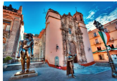
Visit the Church of San Diego de Alcalá