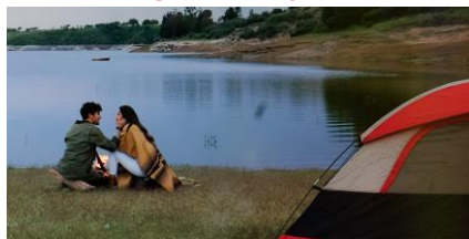
Camp in Tepotztlán