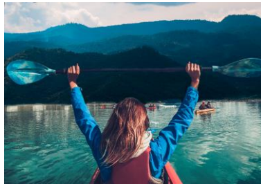
Kayak in Valle de Bravo