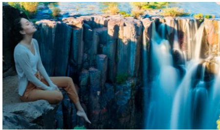
Explore the waterfalls in Acapulco

Estado de México is the most populous state of the country (15 million), which extends around the capital. This state offers a wide variety of attractions, including Teotihuacan, one of the most important archaeological sites in Mexico, picturesque villages, indigenous traditions and beautiful natural surroundings