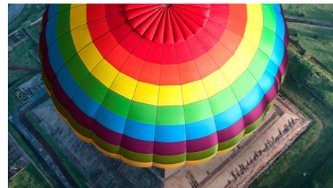
Ride an air balloon in Teotihuacán