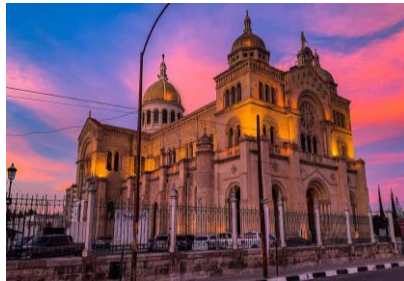
Explore the architecture in downtown Durango