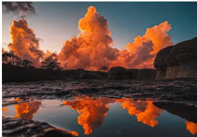
Explore the nature of the Sierra Madre Occidental

Located in the Guadiana Valley, the "Villa de Durango" is part of the El Camino Real de Tierra Adentro (Royal Road of Inland), a World Heritage Site by UNESCO. Many of its imposing buildings are now museums and cultural centers where antiques, religious art and ethnographic collections reflect the customs and talent of indigenous cultures that originally settled in the region.