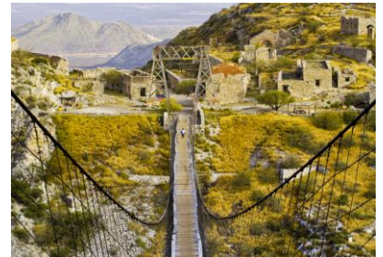
Cross the Ojuela Bridge