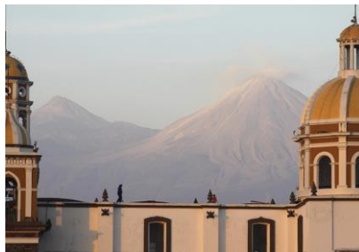
Tour the magical town of Comala