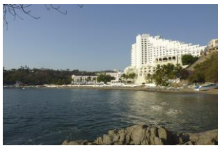
Playa La Audiencia