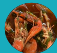
Chigüilines and chacales