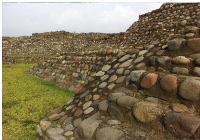
Explore La Campana's archaeological site

Known as the City of Palms, Colima, is a picturesque colonial town that lies between two volcanoes: the Fire volcano, the most active in Mexico, and the Frosted from Colima. Its magical town Comala, known as "the white town of the Americas" was immortalized by the Mexican writer Juan Rulfo's novel Pedro Páramo, the deep waters of the port of Manzanillo hide a marine life treasure ideal for fishing lovers.