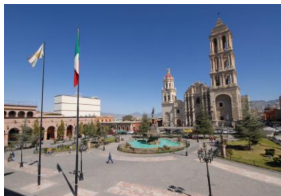
Walk around Plaza Armas in Saltillo