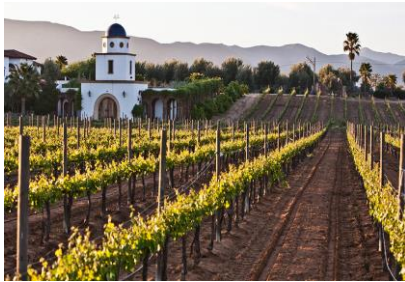
Enjoy a glass of wine from Casa Madero

Dominated by the desert, many of the attractions of Coahuila are in this ecosystem, although some, such as the Four Cienegas Biosphere Reserve are a surprising finding. With about 150 different species of plants and animals endemic from the valley and mountains and because of its fragile and unique ecosystem, the valley is a perfect environment for photography lovers.