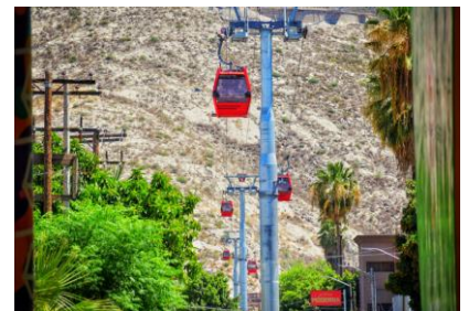
Ride the cable car in Torreón