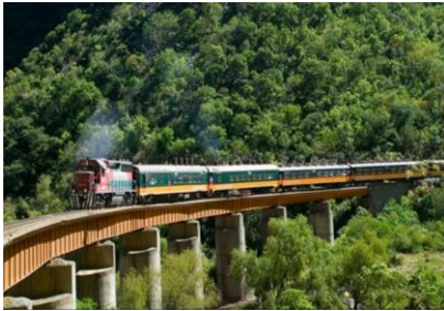
Travel more than 200 miles in “El Chepe” train

In Chihuahua, the Madre Occidental mountain range is displayed with all its grandeur through the mountains, plateaus, amazing rivers, streams, pine forests, waterfalls, caves and of course, the Copper Canyon, one of the largest and most impressive canyon systems in the world, where rocky cliffs and vertical walls 1,500 meters show the broadest and deepest canyons in the country.