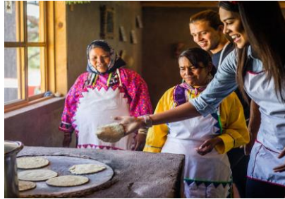
Learn more about the Rarámuri culture