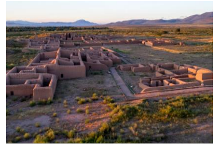
Visit the archaeological site of Paquimé