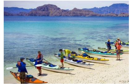
Kayak in the beaches of Loreto