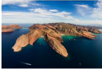
Explore the Espiritu Santo Island, a UNESCO World Natural Heritage Site