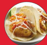
Fish tacos “La Paz” stylex