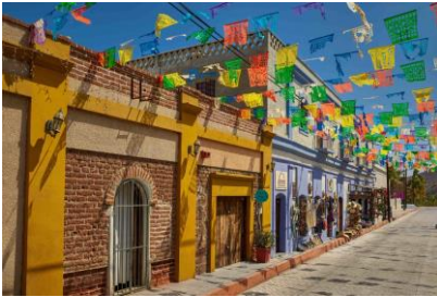
Visit art galleries in the charming town of Todos Santos

Baja California Sur (BCS) is the paradise for sports lovers and the wild life, its climate is an earthly paradise for surfers and allows games of golf all year round, boat trips to the island Espiritu Santo for whale watching and swimming with sea lions. Its pristine beaches are excellent for water sports and also in Cabo Plumo, you can go diving in coral reefs.