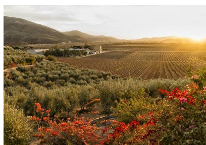
Explore the wine route in Valle de Guadalupe

Experience the whale watching, fall in love with the Wine Route, camp in beautiful natural attractions, do extreme sports on beautiful beaches, experience excursions in the dunes, taste Mediterranean cuisine, learn about the craft centres, community museums, missionary sites, small magic towns and great cosmopolitan cities, be surprised with its cave paintings and other vestiges of the first settlers, and be pampered in the boutique hotels and enjoy unique features that Baja California has to offer.