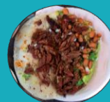
Tacos Rosarito style