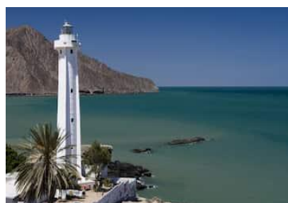
Relax in the beach of San Felipe