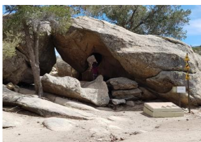
Visit El Vallecito archaeological site