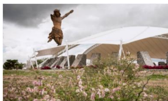
San José Gracia

“Boca de Tunel is a hidden gem, more exciting than anyone that has visited can explain. Located 45 mins from Aguascalientes, this thrilling experience alone is worth the trip from any place located within driving distance”