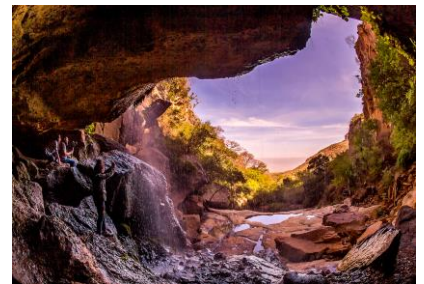
Tour the city of Aguascalientes