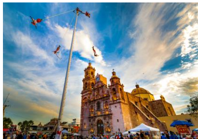
Live it up at the San Marcos fair