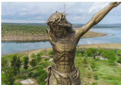
Visit the Sanctuary of the Broken Christ

Some might say that the main attraction is the Fiesta Brava held in the Monumental Bullfight Plaza. However, The San Marcos National Fair, the railway, the clocks, guava sweets, the deshilados (textile craft), and balustrade of San Marcos Park, temples, its architecture and artists are so ingrained in Aguascalientes like its Fiesta Grande. This marathon of activities gives life to this State that is left impregnated in the stones and the air.