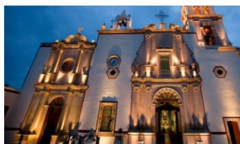
Real de Asientos