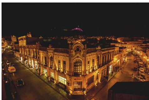
Explore downtown Zacatecas