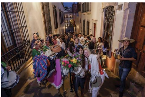
Experience a "Callejonada"

Zacatecas has its origin as a mining state, because its foundation was precisely due to the silver deposits discovery, around which the city developed. Thus, it also became one of the main economic centers of Nueva España. To learn more about Zacatecas mining, it is recommended to get on the train that goes into the depths of El Edén mine. Its tunnels are full with stories and legends, a museum and the unforgettable experience of visiting a real mine.