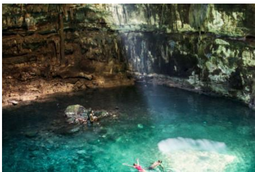
Dive in the cenotes of Cuzamá

Mérida, the capital of Yucatán, arose from the merger of three major cultures: Mayan, Spanish and Lebanese, that together conferred it with a unique personality palpable in its architecture, cuisine and people. In this magical city, tradition and modernity go hand by hand. Impressive archaeological sites, colonial and modern buildings coexist in harmony.