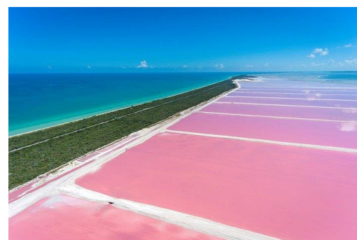
Experience the breathtaking Pink Waters of Las Coloradas