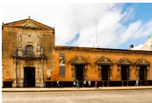
Visit the Montejo House Museum