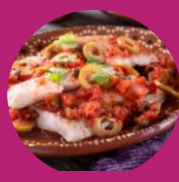
Pescado a la Veracruzana