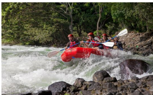
Raft and tube in Jalcomulco