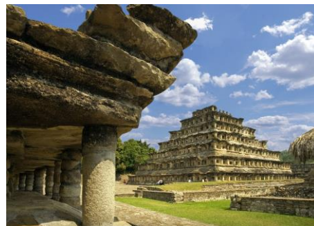
Discover the pre-Hispanic city of El Tajin