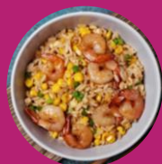
Arroz Veracruzano a la tumbada