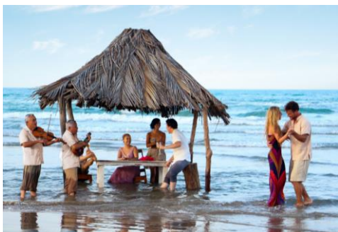
Listen to jarocho music while relaxing in Tuxpan

Veracruz port is a place with a festive atmosphere. There are various attractions, among which the boardwalk stands out, it is ideal for a walk in the afternoon. The Aquarium is located on the boardwalk, this aquarium has the largest sea fish tank in Latin America. In its waters swim Gulf of Mexico's endemic species. The closest beaches are Mocambo which is south to the pier, and Chachalacas, an hour trip north on Highway Cardel.