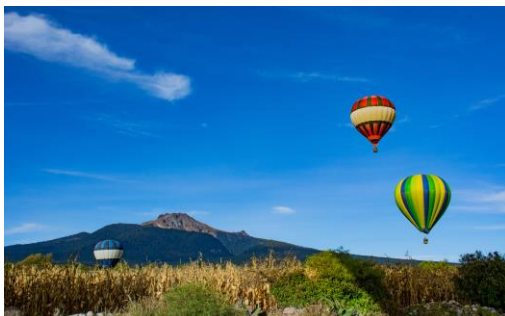
Enjoy an unforgettable experience by riding an air-hot balloon