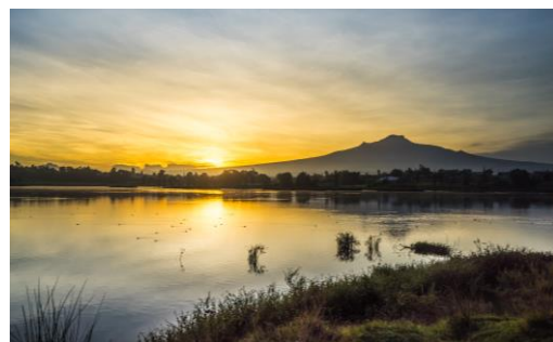
Take a boat ride in Laguna de Acuitlapilco