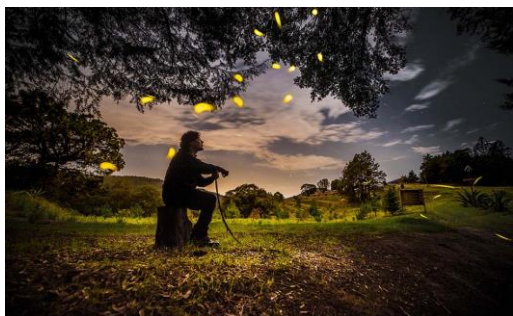
Camp in a firefly sanctuary in Nanacamilpa

Within the heart of the Mexican Republic is Tlaxcala. The climate allows you to admire a great diversity of flora and fauna. Tlaxcala is has been home to many different cultures and people, proof of this is the historical and cultural diversity that is reflected in its buildings and traditions, such as the Historic Center of the capital city, whose initial layout dates back to 1525.