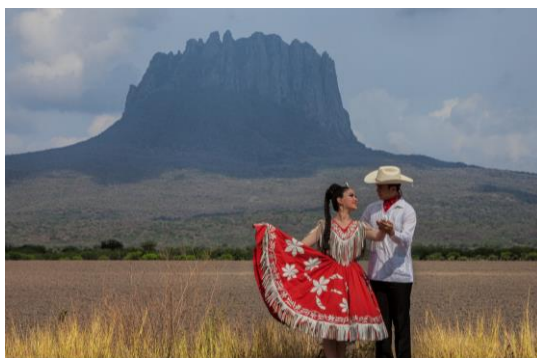
Witness the beautiful views of Cerro del Bernal