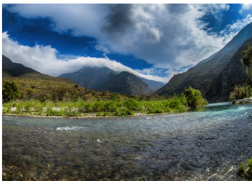
Explore the nature surrounding the Guayalejo River

Come to a rich and diverse state where life is warm and gentle. In Tamaulipas, history and modernity converge to form an almost perfect balance in which culture and nature break through giving you the chance to have unique experiences in a beautiful tourist destination. The state is privileged to have five beautiful beaches that have tourist infrastructure like hotels and restaurants with seafood and typical dishes of the area.