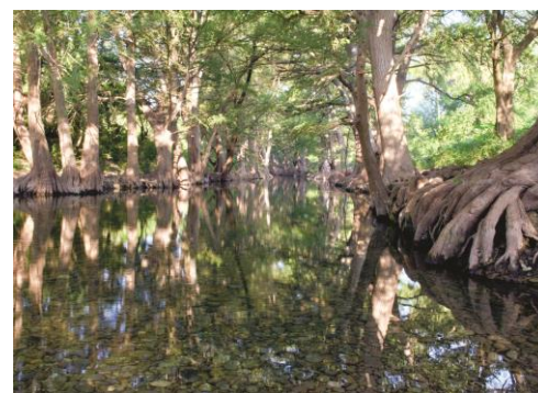
Enjoy a quiet time in Los Troncones park