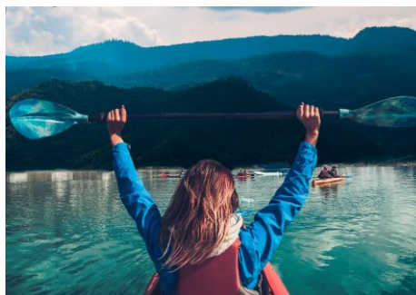
Kayak in Valle de Bravo