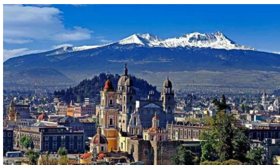
Explore the wonders of Toluca

Located in the heart of the country, the state offers a wide range of destinations and attractions such as its 10 Magical Towns, 23 Charming Towns and four UNESCO World Heritage Sites.