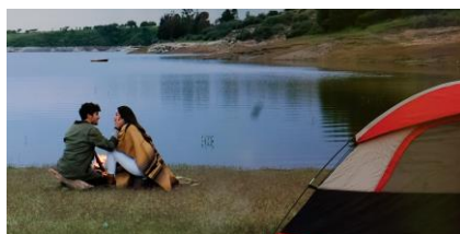
Camp in Tepotzotlán

The natural beauties in the State of Mexico are the perfect place for romantic getaways