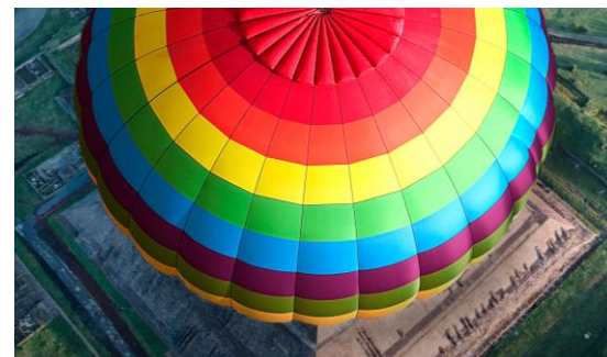
Ride a hot air balloon in Teotihuacán