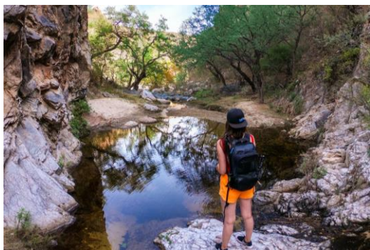
Tour the Magical Town of Santiago

The state of Sonora is surrounded by sea, desert and mountains. It is the ideal destination for any traveler who wants to mix sports with beach and cultural activities. You can choose between a relaxing holiday, enjoying the beautiful landscapes like a sunset with amazing colors in the sky and the waves of the Sea of Cortez, or you can have a holiday full of excitement with extreme sports.