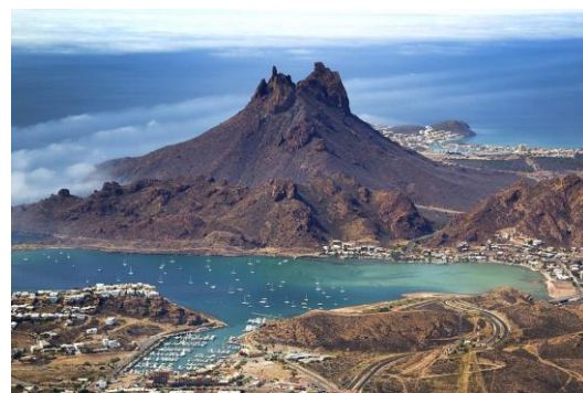
Experience San Carlos