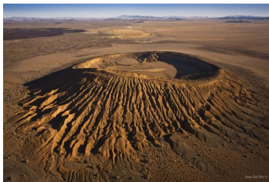
Explore Altar's desert