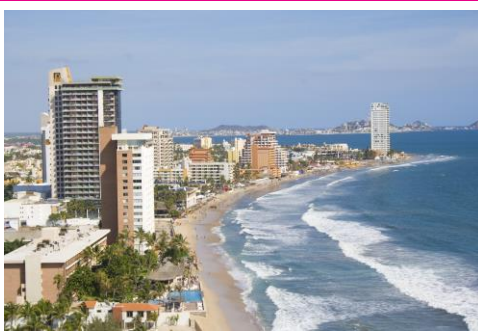
Relax in Mazatlan's beach