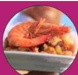
Camarones a la plancha