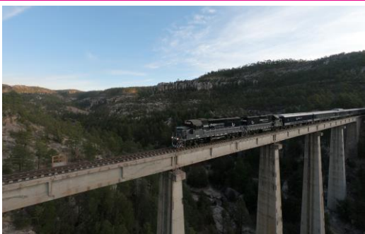
Ride in El Chepe train

Sinaloa has 650 kilometers of coastline, which allows it to offer vast experiences of sun and beach. Its main tourist centers are Mazatlán, Culiacán and Los Mochis. It has 4 Magical Towns: El Rosario, Cosalá, Mocorito and El Fuerte, it also has departures from the only tourist train in Mexico, the Chepe Express route to the majestic Copper Canyon.