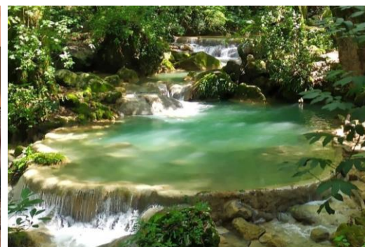
Walk in nature, camping, or simply relax in the Chuvejé Waterfall