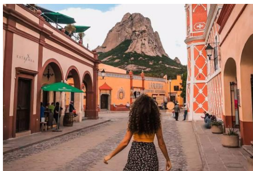
Visit La Peña de Bernal