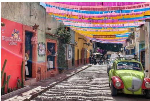
Walk around Tequisquiapan

Querétaro is a geographical jewel of Mexico that has the most diverse attractions for all tastes and interests. From the rich mix between the contemporaneity of its metropolis and vibrant past of its Historic Center, to the natural wonders of its Sierra Gorda, passing through the culinary appeal of its wine and cheese region, or the pure air and tranquility of its southern forests and fields, Querétaro has it all.