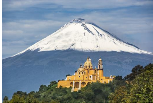
Discover the largest pyramid in the world, The Great Pyramid of Cholula