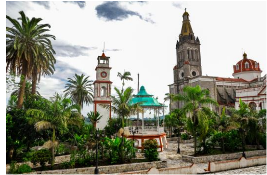
Explore the Grutas de García