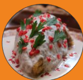
Chile en Nogada