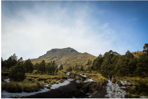
Adventure into la Malinche National Park

Be amazed with the splendor of its elegant colonial buildings, its streets and flavors that honor its nickname "the city of the angels". Legend has it that after the construction of the Cathedral of Our Lady of the Immaculate Conception, engineers and architects wondered how to carry a bell of 8,000 kilos. One morning, residents awoke to the news that it was already at the top. This legend is responsible for this beautiful city being called Puebla de los Angeles.