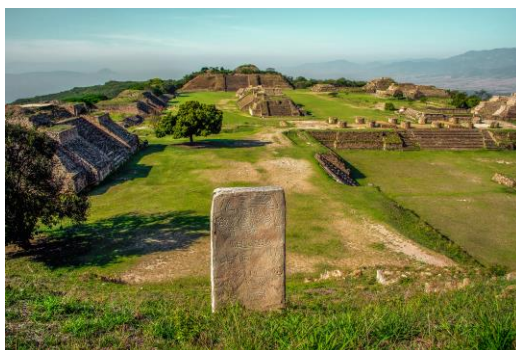
Learn about the Zapotec culture in Monte Albán