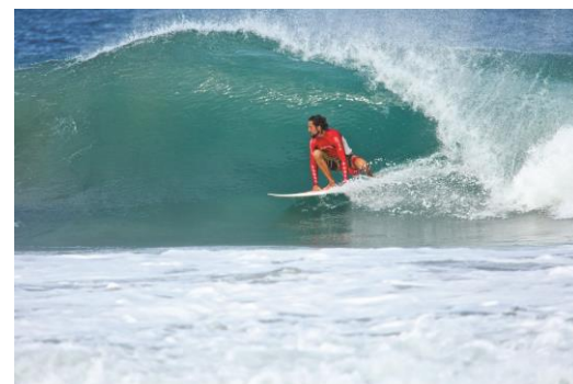
Surf in the beaches of Zicatela