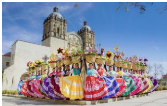
Chinas Oaxaqueñas in Plaza de Santo Domingo