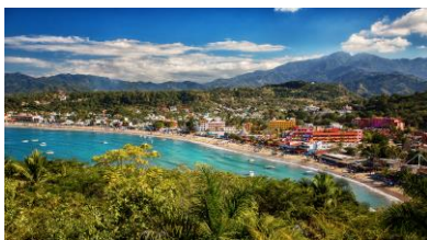
Rincón de Guayabitos