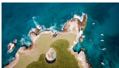
Playa del Amor, Islas Marietas