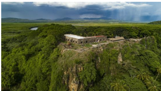
Tour La Contaduría fort in San Blas

If you are looking for tranquility and a natural preserved environment, then visit Nayarit and its 305 kilometers of pristine coastline. The coast ports, both picturesque and peaceful, welcome you to know a little about the Huichol culture. Nayarit is perfect for those who like both historical tours and outdoor activities like diving or swimming in the "World's Greatest Pool".