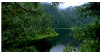
Lagunas de Zempoala