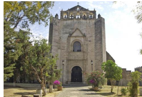
Visit the Magical Town of Tlayacapan