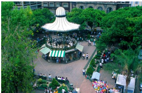
Explore downtown Cuernavaca

Follow the footsteps of the ancient Augustinian, Dominican and Franciscan friars when visiting some of the first temples, convents and churches of European styles that were built in the region for the evangelization of the population. Walk the streets of the so-known state of “eternal spring” in a pilgrimage to Mexico's interesting colonial past. Its name comes from its warm, suitable to practice outdoor activities climate. In addition, the state has a rich culture and history and various attractions you shouldn't miss.