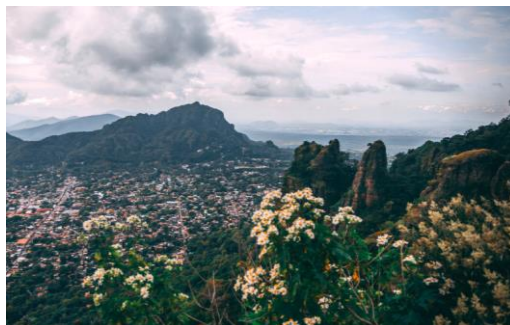
Hike to the top of the Tepozteco for astonishing views of Tepoztlán