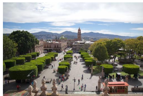
Walk around the Historic Centre of Morelia, a UNESCO world heritage site