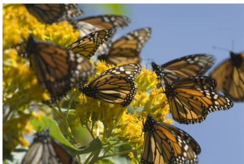
Visit the Monarch Butterfly Sanctuary

It is one of the richest states in lakes, forests and other natural beauties such as the Monarch Butterfly Sanctuary, the Parícutín Volcano, the Eduardo Ruiz National Park or the Camécuaro Lake National Park. The historical center of the capital of Michoacán is an UNESCO world heritage site, few cities include such a strong, diverse and well-preserved colonial architecture as Morelia.