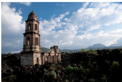
Visit the Ruins of the San Juan Viejo Temple