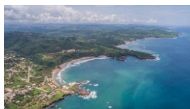
Caleta de Campos