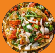
Tacos al pastor