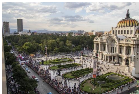
Visit the murals in the Palacio de Bellas Artes

Mexico City is one of the most enjoyable destinations. Its historic center, better known as Zocalo, is declared World Heritage by UNESCO and is the heart of a living culture that exudes everything accumulated since the founding of Tenochtitlan. Visit its neighborhoods flooded with art nouveau and art deco, enjoy its cuisine and lose yourself in the streets of the city with the most museums in the world.