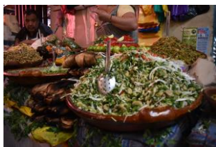
Enjoy traditional Mexican cuisine at a local food market

"Coyoacán known as Land of Coyotes is located on the south side of Mexico City, and this beautiful is a must when you come to Mexico City. In here you can visit the Mercado de Coyoacán, and have a taste of local cuisine, my favorite, Las Tostadas de Coyoacán."