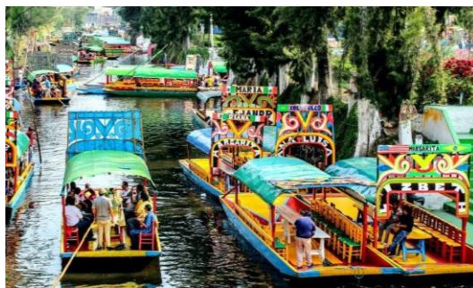
Ride a trajinera in Xochimilco