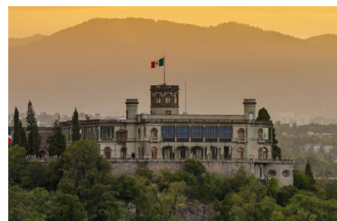
Walk around the Chapultepec Castle