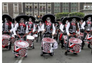
Day of the Dead parade in November