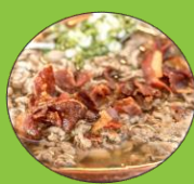
Carne en su jugo