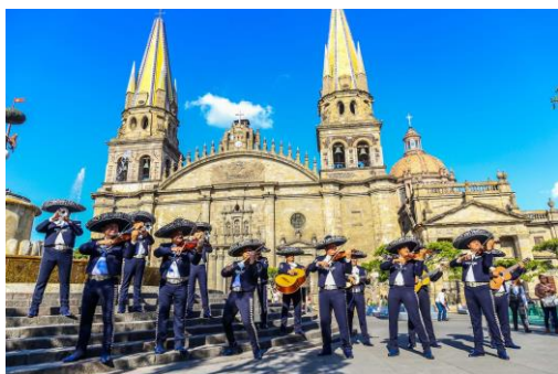
Experience the International Festival of Mariachi in Guadalajara

Mariachis and Tequila are brought together in the central-western part of Mexico, geographic point where the state of Jalisco is located, with its kind lands that have become a synonym of Mexicanity. A trip through some of the corners of Jalisco can become an exciting adventure, like performing various ecotourism activities such as camping and water sports, which allow an approach with nature.