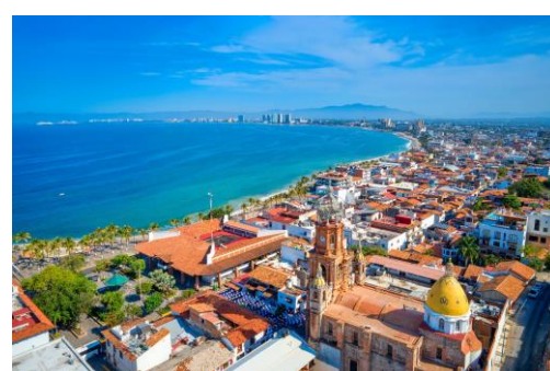
Fall in love with the wonders of Puerto Vallarta