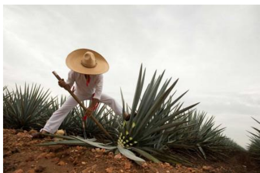
Learn about the origin of tequila