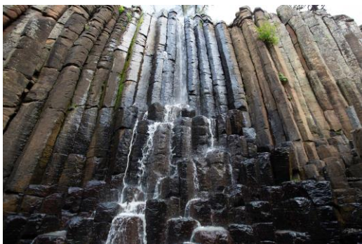
Take a splash in the Balsatic Prisms

Hidalgo promises visitors a wide range of options, from outdoor activities to cultural immersion in the ancient and recent history, in addition to a rich culinary tradition. Its basalt prisms, mining history, thermal waters and archaeological sites provide travelers an unforgettable experience.