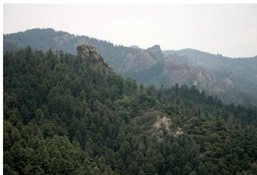
Camp in El Chico National Park