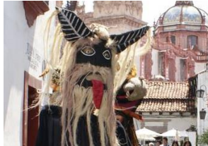
Dance of the Devils

"(Acapulco) a place full of nature in which you can have a lot of fun with water activities since from there you can see the best divers in the creek sometimes there are diving competitions and they compete to see who is the best to really live this experience firsthand It is wonderful since the emotions that you feel have no explanation..."