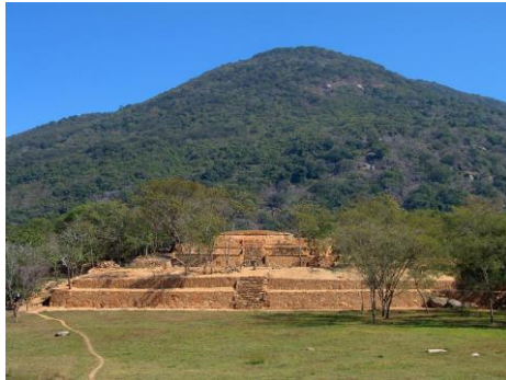
Explore the archaeological site of Tehuacalco