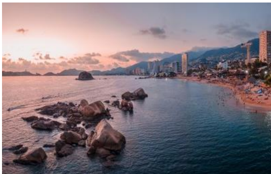
Watch the sunset in Acapulco

World famous, the Acapulco port is still the classical beach destination of Mexico. However, Acapulco is one of many beach destinations of the state of Guerrero, and it is part of the touristic route called "Triángulo del Sol" or Sun Triangle, which includes Ixtapa, Zihuatanejo and Taxco.