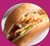
Guacamaya (pork sandwich)