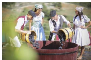
Route of the Wine