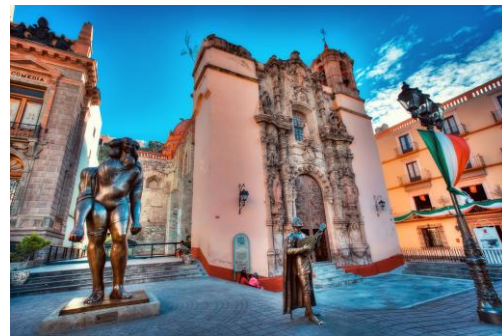
Visit the Church of San Diego de Alcalá