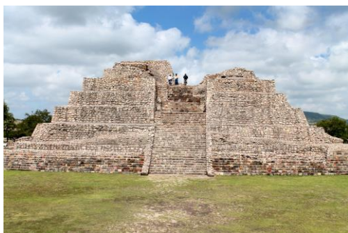
Discover the Otomi archaeological site of Cañada de la Virgen

The city of Guanajuato, declared Patrimony of the Humanity by UNESCO, and the "Ruta de las Minas" or Mines route, that cross-cuts its municipalities, and its scrumptious and honest gastronomy make this state an excellent destination that reunites Mexican traditions with the novohispano culture. Just as bright in its underground lifestyle as in surface, Guanajuato is the headquarters of some of the most important cultural samples in the world: The Cervantino International Festival.