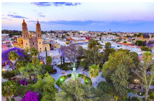
Explore the birthplace of the Mexican Independence in Dolores Hidalgo